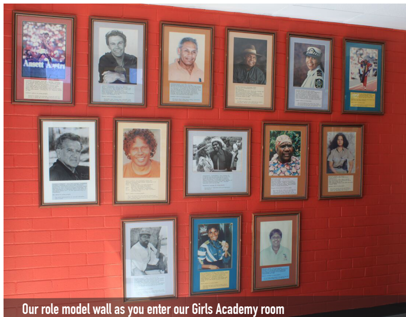
Our role model wall as you enter our Girls Academy room