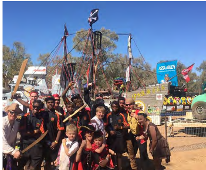
Yirara College Academy with the Pirates