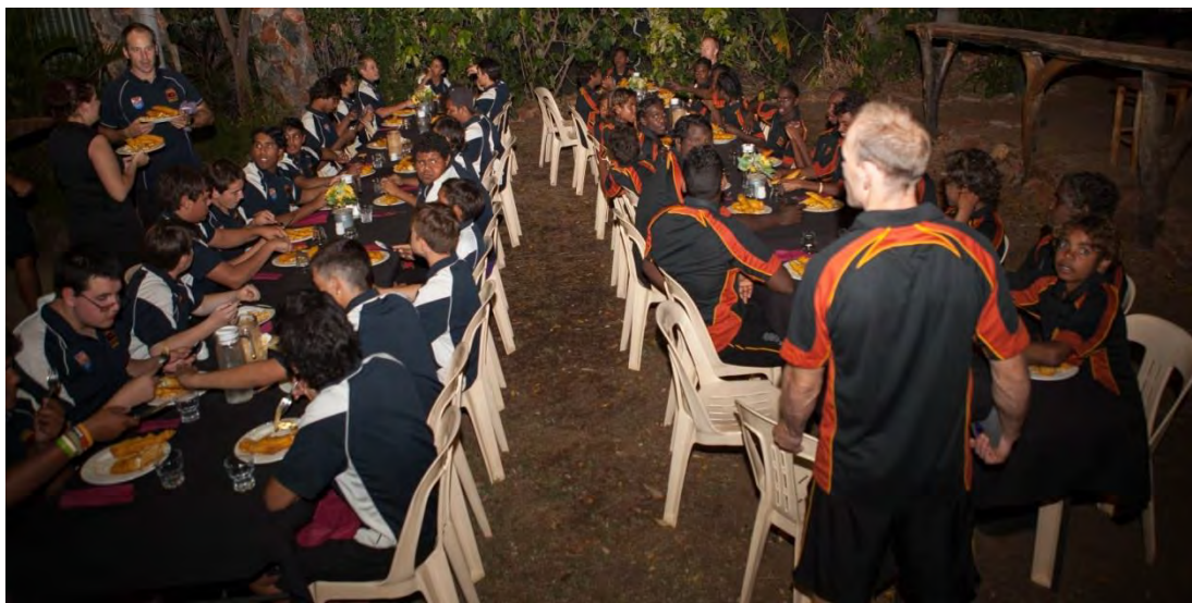
Yirara and Centralian Middle School Academies having dinner at Kununurra