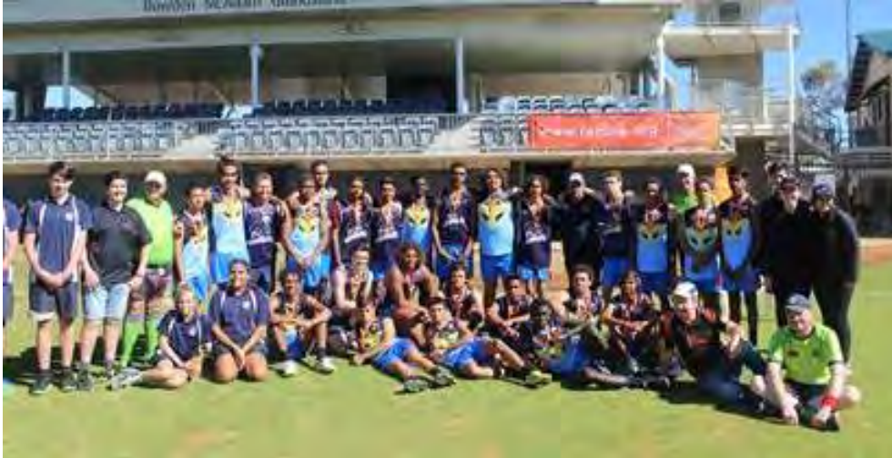
Centralian Senior College Academy members with Reclink Staff and Umpires

Clontarf Desert Eagles participated in the Reclink Grand Final day at Trager Park. Twenty two Academy members played in both teams in an exciting brand of football, with Reclink Roos winning by one goal. This activity was to support Reclink - an organisation whose mission is to provide and promote sport and art programs for people experiencing disadvantage. Our Academy members enjoyed the day meeting new people and learning about Reclink.