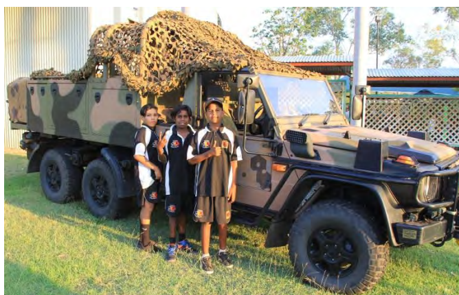
Tennant High School Academy members at the Northforce Base in Kununurra