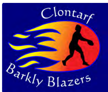
Tennant Creek Academy "Blazers"