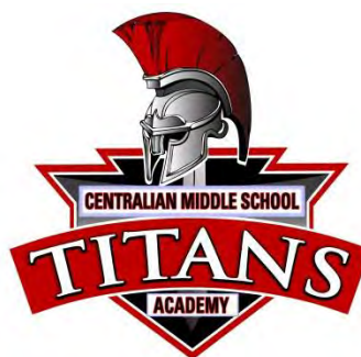
Centralian Middle School Academy "Titans"