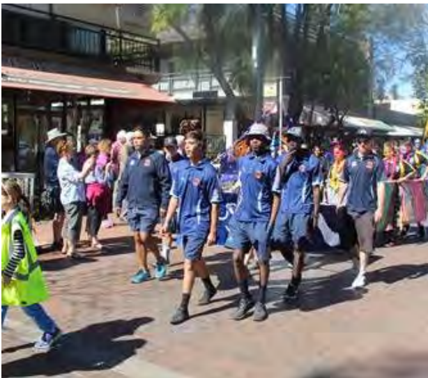
Centralian Senior College Academy