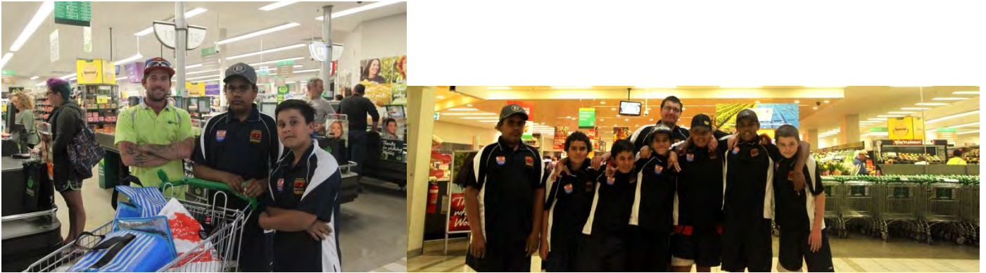
Centralian Middle School Academy members at Yeperenye Shopping Centre