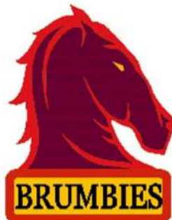
Yirara Academy "Brumbies"