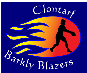
Tennant Creek Academy "Blazers"