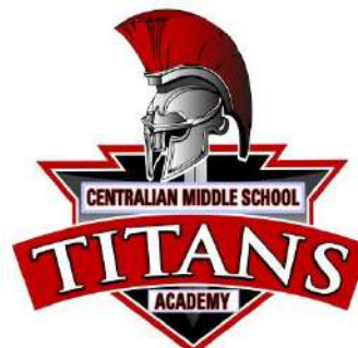
Centralian Middle School Academy "Titans"